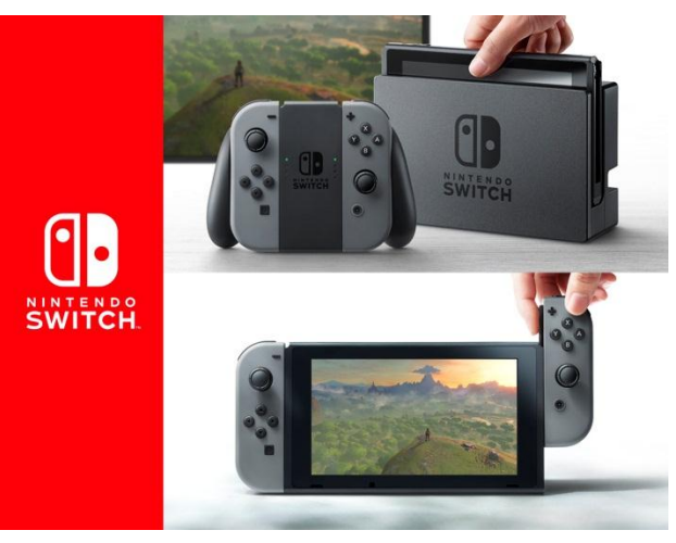
Nintendo Switch to be released Spring 2017.

An F2P game is one you can download and play for free.