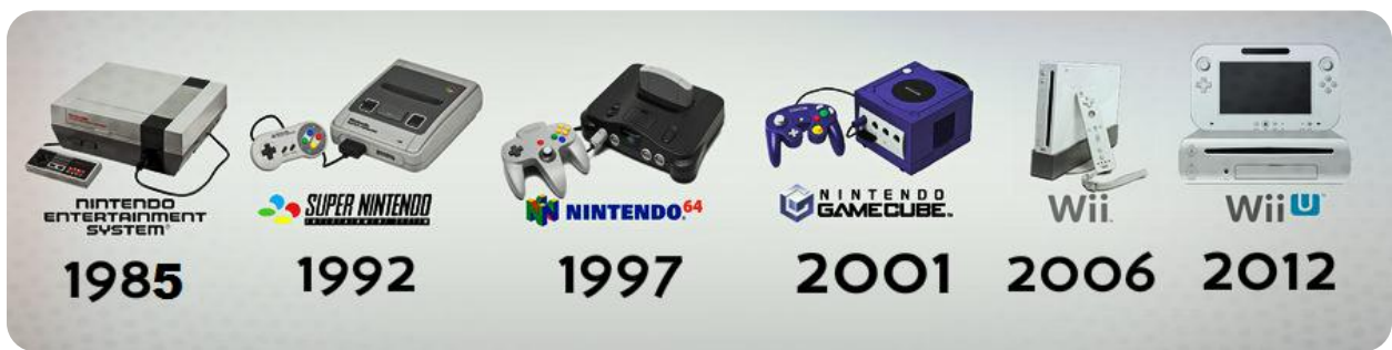
Nintendo released six home consoles from 1985 to 2012. In 2017 it will release its seventh.

It was Nintendo's NES (Nintendo Entertainment System), which was sold all over the world in 1985, that started Nintendo's success. The game Super Mario Bros . came free with the NES. After that, Nintendo released five more home consoles. Nintendo will release its sixth console in 2017.