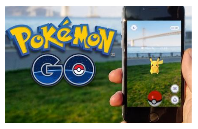
Pokémon Go for mobile phones released July, 2016.

In 2016 Nintendo released Miitomo , Pokémon Go , and Super Mario Run . Nintendo's iOS games are F2P (free-to-play), but they have in-game stores that let you spend real money to buy in-game things. In 2017 Nintendo plans to release an Animal Crossing game and a Fire Emblem game on iOS. Animal Crossing and Fire Emblem are popular game franchises from Nintendo consoles.