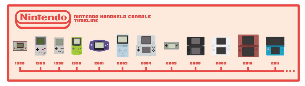
Nintendo started making portable gaming consoles in 1988. The first portable console only had one game on it.

Nintendo also created multiple mobile game consoles that you could carry with you when you go out. The first successful mobile console, the Gameboy, was only black and white. It was released in 1989. The most recent mobile console is the 3DS, which can display 3D pictures without using 3D glasses.