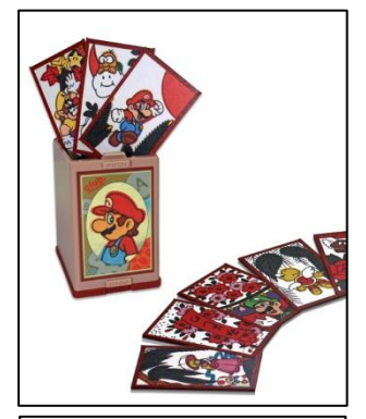
Hanafuda cards, or flower cards, have 12 different suits by month of the year and have symbols instead of numbers.

Nintendo is a well-known Japanese video game company. It also makes consoles (kuh-n-sohls). Consoles are video game systems that let you play games on a TV or in your hands.