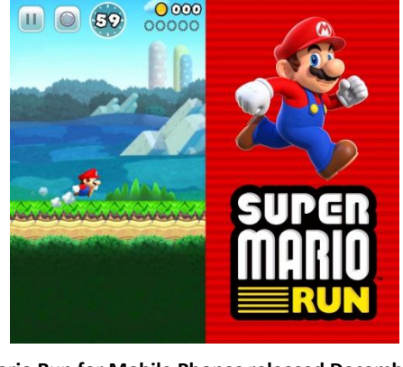
Super Mario Run for Mobile Phones released December, 2016.

Nintendo is famous for making games that only work on Nintendo consoles. But this year, Nintendo finally started to release games for iOS, which is for iPhones and iPads. Nintendo also plans to make more games for iOS and other phones.